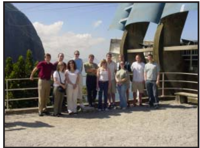
Above: Students strike a pose on top of the Pão de Açúcar, Rio de Janeiro

Included in the coursework, and as part of our preparation for the trip to Brazil, we learned about Brazilian business and social customs and practices. This included understanding the Brazilian notions of time, personal space, hierarchy and the importance of relationships in business.