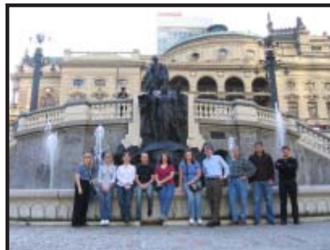
Left: Students visited São Paulo's Teatro Municipal while in Brazil.