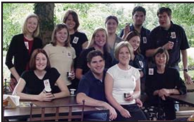
Above: Students on the 2003 journalism class at Cafe Britt.