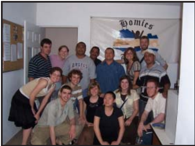
Above: The delegation of KU students who contributed to the community of El Papaturro, El Salvador.