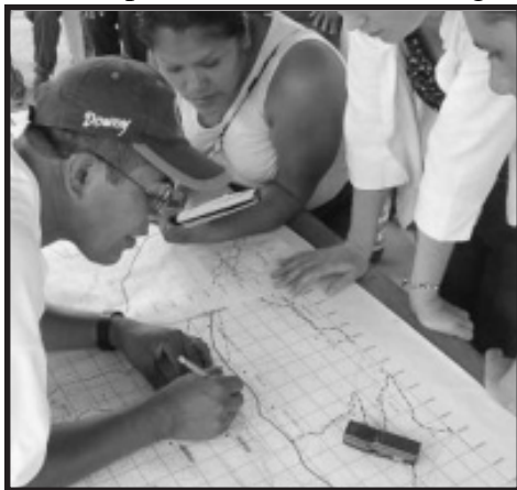
Left: Local investigators and project team members create a community map.

The project relies on participatory research, especially mapping, to develop its understanding at the local level and thereafter to "scale up" the interpretation from the individual parcels of indigenous farmers, to the community, study area, Huasteca region, state, and finally national levels. It also allows the study of over 300 different variables in a GIS to show how the new land titling program (called PROCEDE) has affected indigenous life in Mexico. Participatory research is a methodological approach to carry out crucial research functions and practical goals by trained residents of the study area communities - without the academic researchers. The research team has incorporated the data from this grassroots