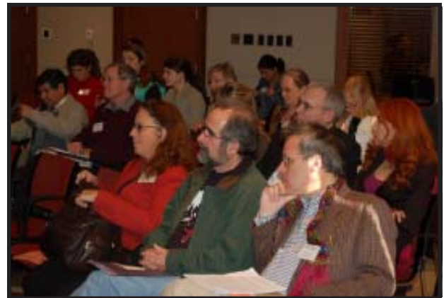
Above: Participants listen attentively.