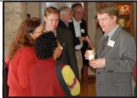
Right: Scholars interact during coffee break.