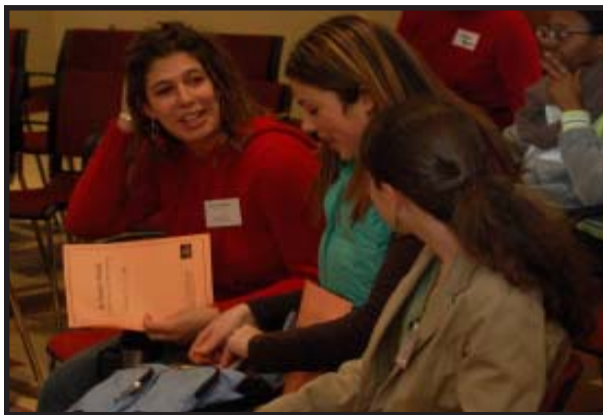
Above: Graduate students interact at the Andean Conference right before a panel began.

Political Economy and International Relations; Indigenous Politics and Natural Resource Management; Race, Ethnicity and Identity; Civil Society, Human Rights and Governance; and Migration and Urban Geography in the Andes.